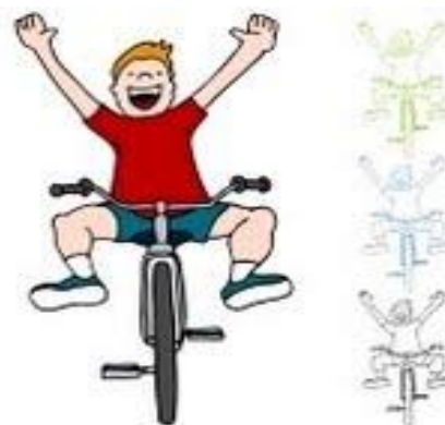
Figure 3: The new way

The story here is simple, my friends. You will be moving into an energy where you do not need to pedal, where you do not need to "figure out" what to do next. Where you do not need to battle in your own mind "what it is you should know" or "what it is you should do" for it will come to you. You will be in a place of grace and peace and empowerment. The SCENERY will change. It will come to you as appropriate. It is not a simple, two-dimensional road that you will be on. The scenery is multi-dimensional and will change constantly all around you. You simply need to be in the Present Moment. You do not need to worry about where you should be or what you should be doing next. For when you sit still upon your bicycle, you will come to a knowingness that all things are as they should be. That you do not need to worry about your next experience, for it will be drawn to you from the grand potentials. From the choices that are out there, the appropriate new "backdrop" will be brought to you.