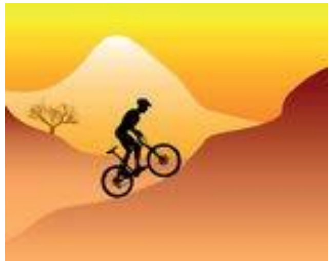
Figure 2: The old way

Oh, there are many blessings, but it is a difficult journey. I use the metaphor of the bike because it is not so simple as getting in the car and turning on the key and pressing the gas pedal. No, the journey of the human up to now has one of been having to pedal and steer and try to figure out where to go without a map, and without knowing - "falling" into experience.