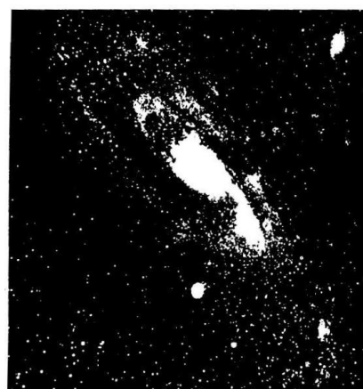
Figure 2: Wherever this form appears in Nature, whether in loops of force in an electric current – sound vibrations of a