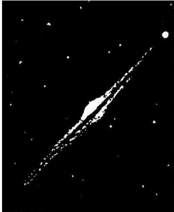
Figure 3: Nature creates bodies by winding light-waves into incandescent spheres, then destroys them by unwinding them into space

harp string –in a chemical element such a carbon – or a giant nebula such as the above pictured Andromeda Nebula, it means that life and death, sex oppositions, centripetal and centrifugal forces, and generation and radiation have reached perfect balance in each other. It is maturing point of each cycle where the two opposing pressure conditions which create matter unite with each other.