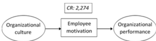
Figure 2: Hypothesis testing results

The results of hypothesis testing of employee motivation mediating the influence of organizational culture on organizational performance can be presented in Figure 5.1 below: