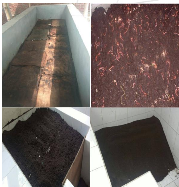
Figure 1: Different stages of Vermicompost