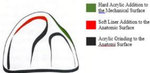
Figure 1: Prosthetic Feeding Aid anatomy surface modification [8]

Expected movement from PFA care is the major segment move to palatal and minor segment move towards the major segment. The modification series that was done by PFA are selective grinding and soft liner relining as in figure 1. Selective grinding process is done on major segment palatal part of the PFA anatomy surface and on the labial part of minor segment PFA anatomy surface. Soft liner relining is done on major segment PFA anatomy surface for about 1-1.5 mm[8].