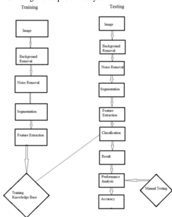
Figure: Raisins Grading System Flow chart