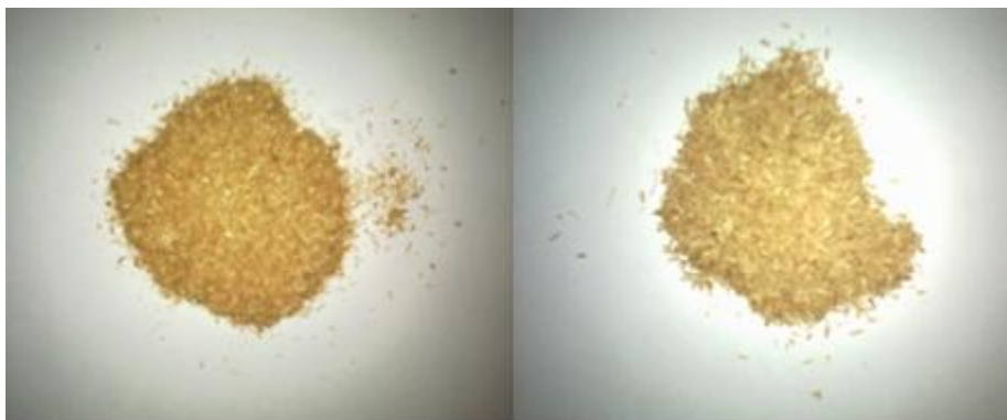
Figure 5: Face Particles