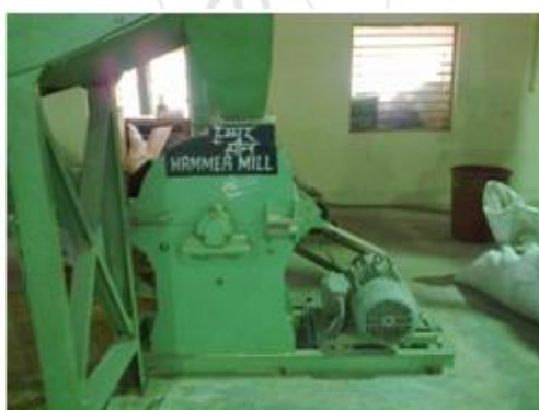
Figure 3: Hammer mill in closed position