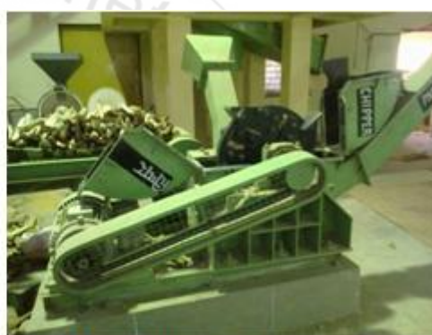
Figure 2: Disc type Chipper in open position