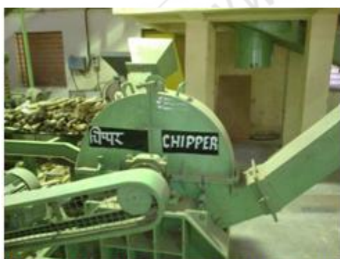
Figure 1: Disc type Chipper in closed position

Particle boards were produced using standardized methods which are in par with industrial production practices. The ratio of face: core particles was 40:60, these particles were oven dried to a moisture content of 3-4%.