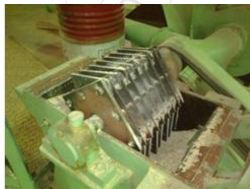
Figure 4: Hammer mill in open position