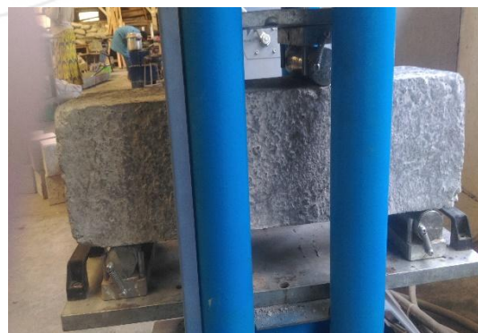
Figure 1: Flexural strength test

Tensile split test was carried out according to BS EN: 12390: 2009 to determine the tensile strength of concrete in an indirect way. Standard test cylinders of concrete specimen of 300 mm X 150 mm were prepared for the various percentages of replacements of cement with bagasse ash in glass concrete at 0, 5, 10, 15, and 20%. For each replacement, three cylinders were cast, cured and tested and the results are shown in Table 3. The average tensile strength was taken for 7 and 28 days; hence a total of 30 cylinders were prepared.