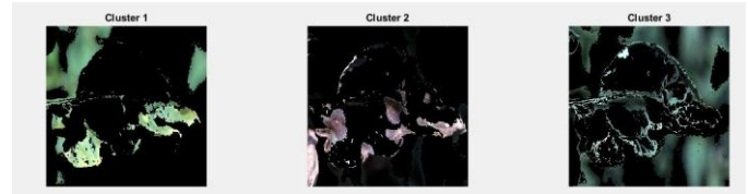
Figure 4: Image Clusters 1, 2 and 3

d. Image pixels are labelled with the index of nearest centroid of their corresponding histogram bins. A labelled image l(x, y) is obtained in this step, and K -Means clustering is finished. [11].