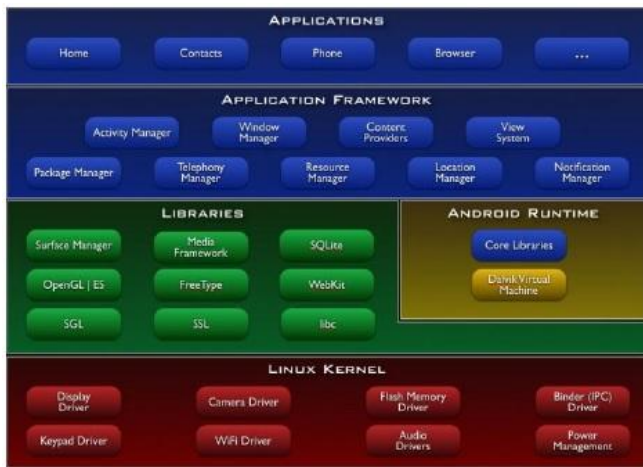
Figure 1: Android Architecture

companies devoted to advancing open standards for mobile devices. Google released most of the Android code under the Apache License, a free software and open source license.