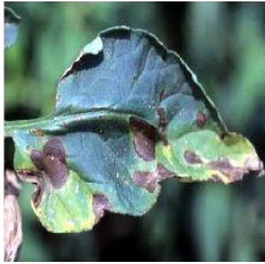
Figure 3: Image Acquired