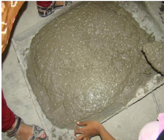
Figure 3: Fresh concrete of SCC

After testing the SCC and HRSCC in fresh state the concrete was poured in moulds of cubes, cylinders, prisms and beams. After 24 hours of casting the specimens were de-moulded and placed in water for curing. After 28 days of curing the specimens were taken out from water and allowed the surfaces for drying.