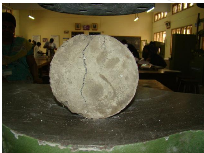
Figure 1: Specimen of Cylinder