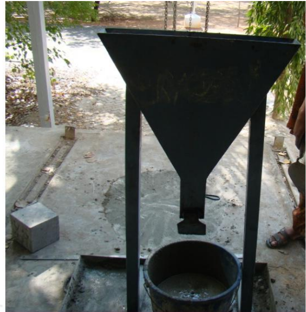
Figure 5: V - Funnel