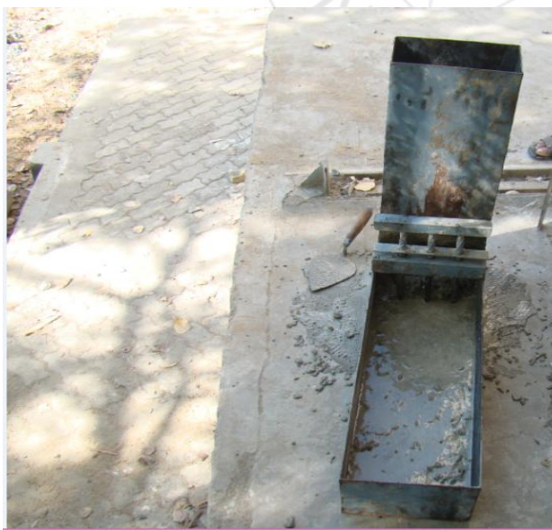
Figure 4: L - Box