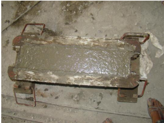
Figure 2: Casting of Prism