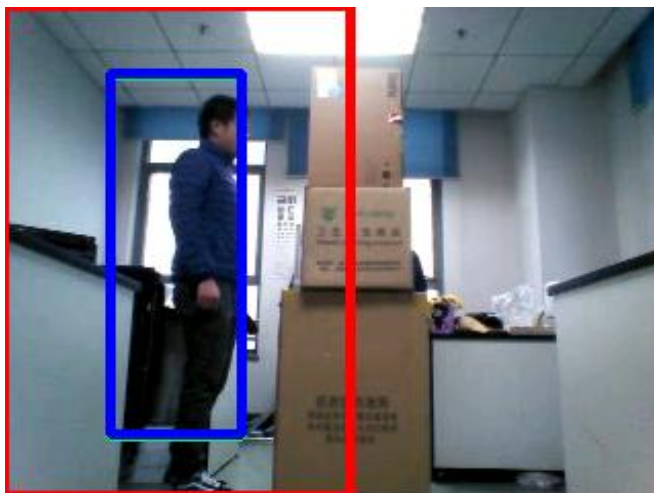
Figure 3: Start tracking effect

complex background and occlusion. It also has well tracking effect.