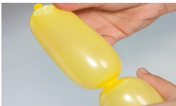
Figure 3: Two expanded sides are two masses. The shrunk-side in between is real free space. The transitions from expanded sides to shrunk-side are energies.