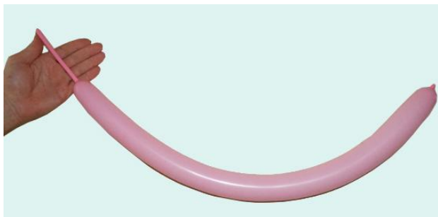
Figure 1: If the shrunk-side of the balloon represents real free space (“sub-normal” space-time fabric), then expanded side must be mass (“abnormal” space-time fabric). The transition from shrunk-side to expanded side is nothing but “Quasi-sub-normal” space-time which is energy (for example, gravity).

Where F is the force acted between two masses, d is distance between the two masses. The difference among real free space, masses and energies are illustrated with some real life figures of balloons that we encounter day to day life where shrunk-side, expanded side and the transition in between explains the real free space, masses and energies.