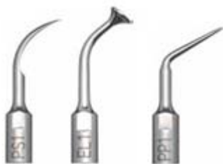
Figure 5: Blunt Insert Tips

Blunt insert tips (Fig 5) are used for preparing the soft tissue. For example, for elevating Schneider's Membrane or for lateralizing nerves. In periodontology, these tips are used for root planing.