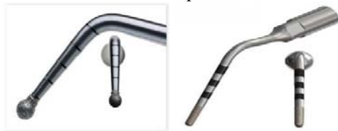
Figure 1 Figure 2 Smoothing Insert Tips

The smoothing insert tips have diamond surfaces enabling precise and controlled work on the bone structures. Smoothing insert tips (Fig 1 and 2) are used in osteotomy when it is necessary to prepare difficult and delicate structures. For example, those preparing for a sinus window or access to a nerve. In osteotomy, smoothing insert tips are used to obtain the final bone shape.