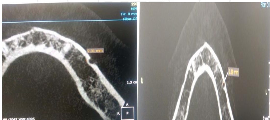
Figure 1: The measurement of the most anterior part of AML (left) and the measurement of the most mesial part of AML (right).

All data collected and analyzed. the prevalence of anterior mental loop was calculated, the mean value, range, SD of the anterior loop length and its location were calculated.