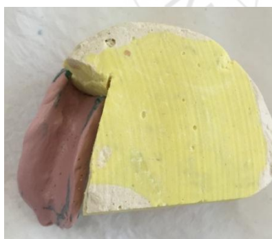
Figure 2: The cast is altered after final impression

The first model was altered by cutting the residual ridge at 0.5-1.0 mm distal to the last remaining tooth the cut surface of the cast was then grooved inattentions to provide retention of newly poured stone as shown in Figure (2). Beading and boxing was done and pouring the impression using dental stone to produce the first altered cast which is considered to be control cast of this study.