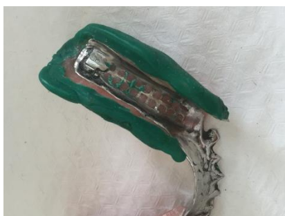
Figure 1: Border molding was done using low fusing compound stick

for proper seating of the tray and to the pressure during impression. After mouth preparation was done, final impression was made with alginate impression material (Zhermack, Italy) to gain the cast where the investing and casting was completed and the finished frame work was examined to ensure the fitness orally, Duplication of the master model to produce three models to be used in the study using putty type silicone duplicating materials (Elite Zhermack-Italy), in order to be serve the original master model. An acrylic resin custom tray was attached to the metal frame work, border molding was done using low fusing compound stick (Hoveman, Germany) and final impression was made with Zinc oxide eugenol impression (SS White England) with finger pressure was applied only to the parts of the framework that comes in contact with teeth (Figure 1).