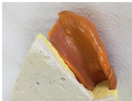
Figure 3: Altered cast impression technique using light body silicone final impression

The second altered cast was produced by making the final impression using light body silicone (Zhermack-Italy)(Figure 3) as an impression material and with putty type silicone as border modeling material and the third altered cast was produced by making the final impression with very light body silicone (Zermack-Italy) (Figure 4) as an impression material with putty type silicone as border modeling material.