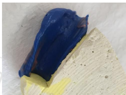
Figure 4: Altered cast impression technique using very light body silicone final impression

The same procedure of cast alteration and pouring were followed as in the first altered cast.