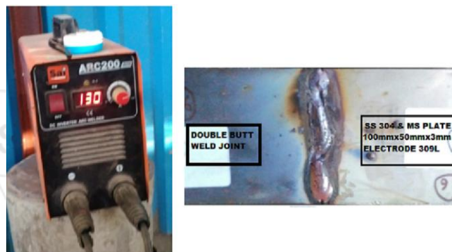
Figure 1: Manual metal welding

The chemical composition of stainless steel is mentioned in the table1 and mild steel is mentioned in the table 1 as given below. The size of plate for stainless steel 100mmX50mmX3mm and for mild steel is 100mmX50mmX3mm are welded and allowed to cool at room temperatures.