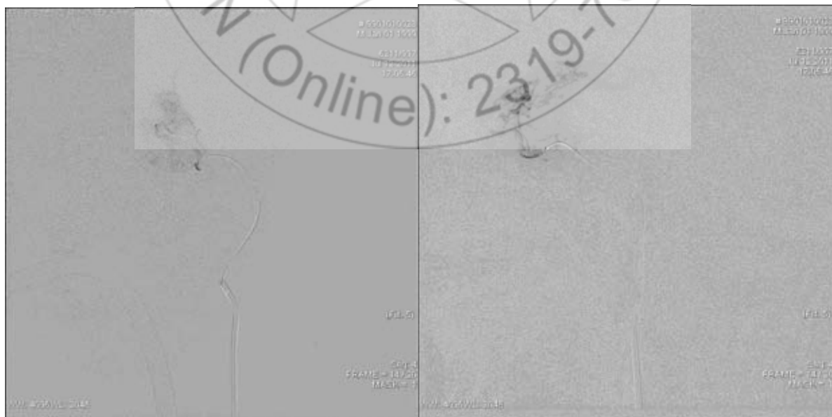
Figure 2: Selective angiography of a maxillaris on the left

Using a micro catheter and micro introducer a selective catheterization of the feeding maxillary artery branches was performed and they were embolized with Onyx.