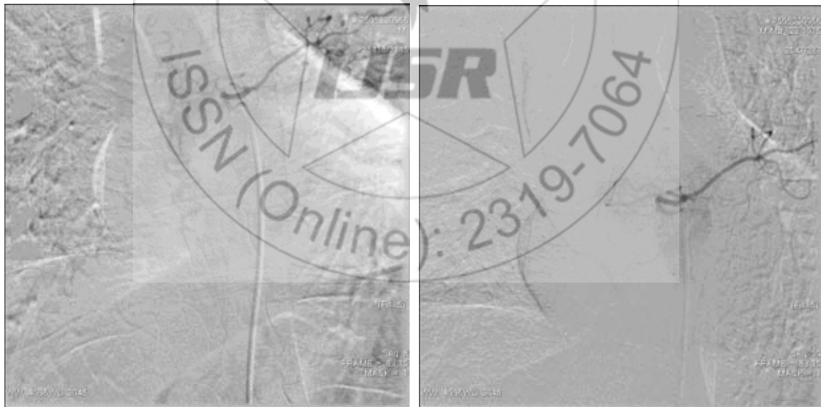
Figure 5: Embolization of the pathological shunt at Th6-Th7 level on the left

by Seldinger. A selective catheterization of the left anterior spinal artery was realized at Th6-Th7 level. By introducing Apollo microcatheter or SilverSpeed microguidewire, the level of the pathological shunt was reached. By administering the long-lasting, non-adhesive embolic agent Onyx, we realized a total embolization of the residual arteriovenous fistula. On the conducted control angiography, no filling of the described dilated vein, located intradurally, was visualized. The patient suffered no complications and complaints after the embolization period.