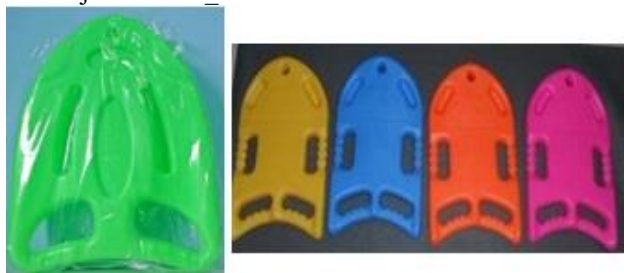
Figure: Various forms of swim board

The aids are aids which used by educators in delivering learning materials. These tools are more commonly referred props because it serves to help and to practice something in the educational process of teaching. According to Samsudin (2008:57) states that. "To carry out the process of the physical activity of course requires completeness of media and teaching aids. Because without the support of the media and aids, the physical education learning process will be in vain" http://sport-physical-education.google.com/2012/06/penerapan-alat-bantu-pembelajaran-untuk_11.html