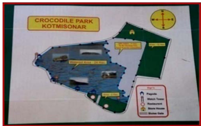
Figure 3: Area of Kotmi Sonar (Munda pond)

Bilaspur and Champa junctions of Chhattisgarh, India [Fig. no. 1]. The Munda pond is spread on 85 acre area. The terrain of Kotmi Sonar is almost plain with gentle slope. The Kotmi Sonar is situated in 620 meters above M.S.L. The underlying rocks are granite, schist and limestone [Bharos and Kanoje, 2007]. In the present study, four study sites [at four corners] were pointed out.