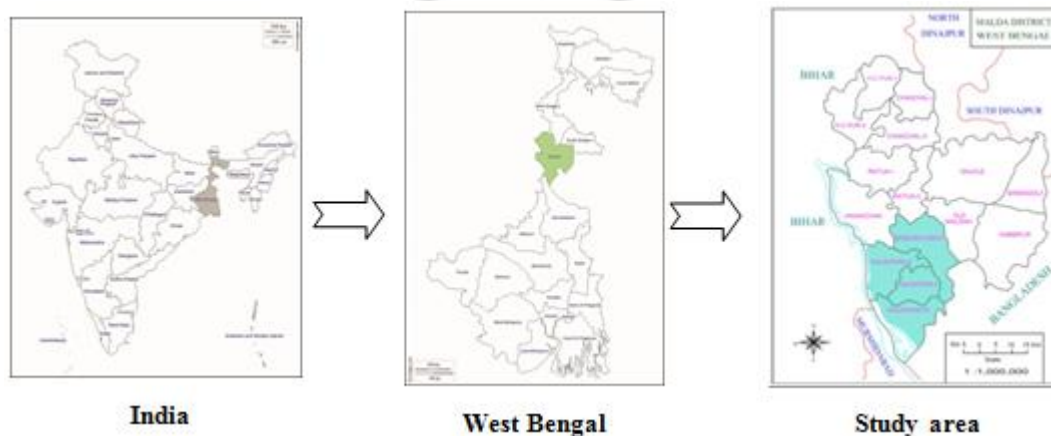
Figure 1: Study Area Location Map

Malda district lies 347 Km North of Kolkata, the State capital of West Bengal (India). The district of Malda in West Bengal has long and rich historical traditions. Total 15 blocks are in Malda district and between them kaliachak (I + II + III) and Englishbazar blocks are our study area.