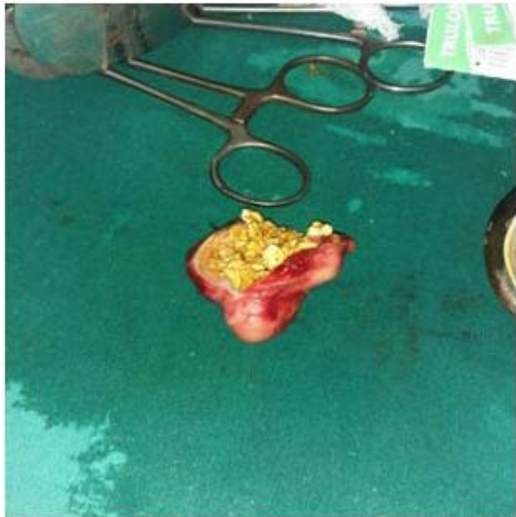
Figure showing gall bladder filled with stones