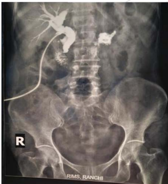
Figure showing free flow of dye in T-tube cholangiogram of the patient