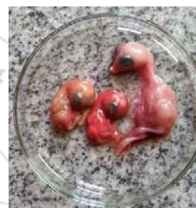
Figure 1: Stunting and curling of embryos infected with IBV (right) compared to a normal non inoculated embryo (left).

The inoculated ECE were daily examined and embryo mortality was recorded. Embryonic deaths occurred between 3-5 days post inoculation with characteristic stunting and curling of embryos after applying three blind egg passages as shown in Fig.1.