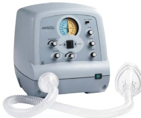
Figure 8: Cough Assistive Device

One year after the trauma, patient was re-admitted in the hospital and decannulated. The Cough was facilitated with cough assistive devices and manual facilitation