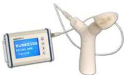
Figure 7: Inspiratory Muscle Trainer