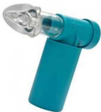
Figure 5: Power Breathe