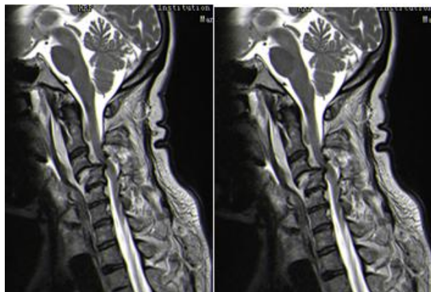
Figure 2 and 3: MRI Cervical Spine of the Patient

On examination, the patient was conscious, alert and oriented to time, place and persons. Build was normal. Her vitals was stable. Tone and Reflexes were absent in all 4 limbs. Power in all 4 limbs was 0/5. Sensation was absent below C4 level. There was no anal tone and perianal sensation was also absent. MRI Cervical spine suggestive of C3-C4 grade III subluxation with anterior translation of C3 vertebral body. C4 corpectomy with C3-5 fusion using meshed cage and plate and screws was done on Day 2. The patient on controlled mode of ventilation. The patient was tracheostomized on Day 4. The patient underwent regular passive chest physiotherapy along with inspiratory muscle training three times a day. On Day 80, the patient was put on dual chamber permanent pacemaker since the patient had bradycardia and hypotension. The patient had difficulty in weaning and sent to the room with the portable ventilator. Passive chest physiotherapy comprising of percussion, vibration, manual hyperinflation and suctioning was done every 4 hours to maintain chest hygiene. Inspiratory muscle training with manual facilitation, Power Breathe, and inspiratory spirometer was done in regular intervals and patient was removed from the ventilator for 10 minutes on regular intervals