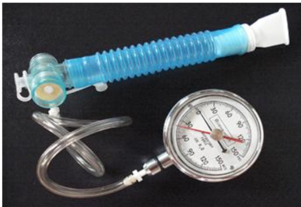
Figure 1: The Boehringer High Pressure Inspiratory Force Meter