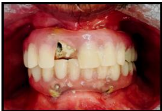
Figure 7: Fracture of acrylic teeth

The total incidence of prosthetic complications recorded was 10 events in the removable group and 14 events in the fixed group (table 1). The relative risk is 0.7143 but the difference is below the statistical significance.