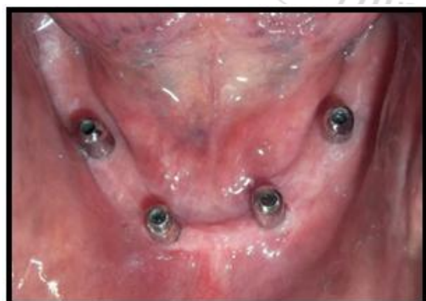
Figure 5: Try in of the abutments done intra-orally

In the telescopic overdentures plastic burnout cylinders were placed on the implant analogues. Wax pattern was trimmed using a surveyor in order to set the 4 abutments parallel to each other. Plastic abutments were casted into chrome cobalt alloy. Try in of the abutments was done intra-orally (Figure 5). Wax patterns were constructed for the frameworks of the overdentures. After casting, the frameworks were tried intra-orally. The overdentures were processed, finished and polished and checked intraorally (Figure 6)