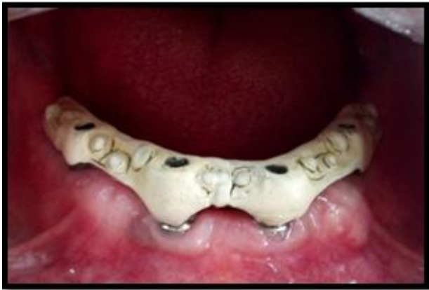
Figure 3: Intra-oral view of the metal framework after application of the opaque