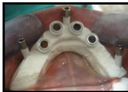
Figure 2: Mandibular surgical guides

for the next 5 days. Analgesic drug (Ibuprofen 600mg, Knoll AG, Ludwigshafen, Germany) was prescribed once daily or when needed.