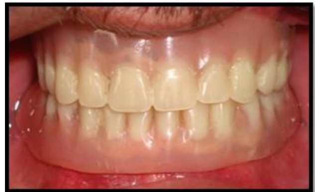
Figure 6: Intraoral view of the maxillary and mandibular dentures