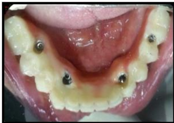
Figure 4: Intraoral view of the final restorations in place

In the telescopic overdentures plastic burnout cylinders were placed on the implant analogues. Wax pattern was trimmed using a surveyor in order to set the 4 abutments parallel to each other. Plastic abutments were casted into chrome cobalt alloy. Try in of the abutments was done intra-orally (Figure 5). Wax patterns were constructed for the frameworks of the overdentures. After casting, the frameworks were tried intra-orally. The overdentures were processed, finished and polished and checked intraorally (Figure 6)