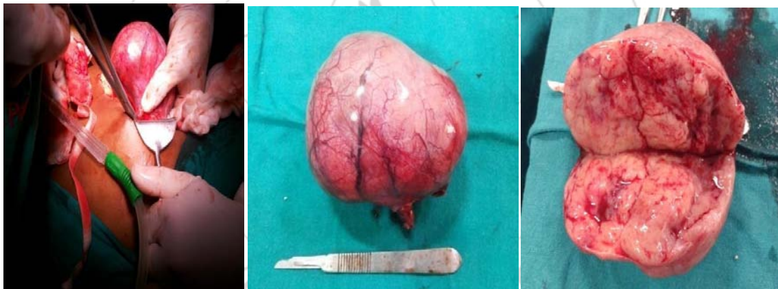
Figure 2: Intraoperative, excised & cut section of intra-abdominal undescended testicular mass

We planned for surgical removal of undescended testicular mass. We went for laparotomy with lower midline incision and found a huge growth occupying the lower abdomen. The growth was excised after ligating its stalk. (Fig2)