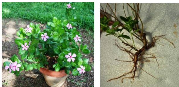
Figure 1: Catharanthus roseus Plant and Roots

Catharanthus roseus (Periwinkle) is a species of Apocynaceae family. Synonyms include Vinca rosea , Ammocallis rosea , and Lochnera rosea ; other English names occasionally used include Cape Periwinkle, Rose Periwinkle; Rosy Periwinkle, and "Old-maid". It is also widely cultivated and is naturalized in subtropical and tropical areas of the world. It is an evergreen sub-shrub or herbaceous plant. The species has long been cultivated for herbal medicine and as an ornamental plant. In traditional Chinese medicine, extracts from it have been used to treat numerous diseases, including diabetes, malaria, and Hodgkin's disease. The substances vinblastine and vincristine extracted from the plant are used in the treatment of leukemia. It is noted for its long flowering period, throughout the year in tropical conditions (Gamble, 2008: *).