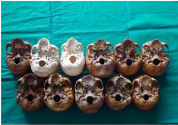
Figure 1: Completely and incompletely ossified pterygospinous ligament