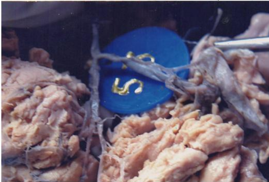
Three Divisions Of Middle Cerebral Artery