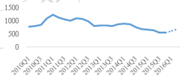
Figure 2: CPO Price change during the years of 2010-2016

The palm oil price changes in the period of 2010 to 2015 showed a decline trend, the decline is thought to have an impact on the trend of listed palm plantation subsector stock returns. CPO prices showed a trend to rebound in the first quarter 2016 to the second quarter of 2016. The increase in CPO prices could be a positive sentiment to the oil palm plantation subsector issuers in year the of 2016. This can be seen in Figure 2.