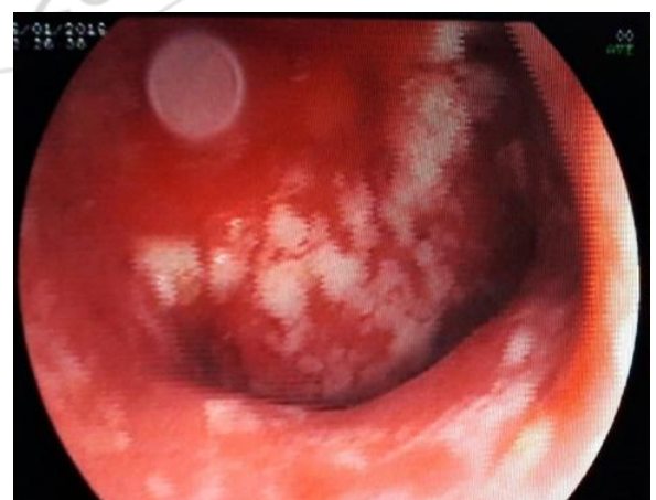
Figure 2: Image showing IBD? Crohn's disease