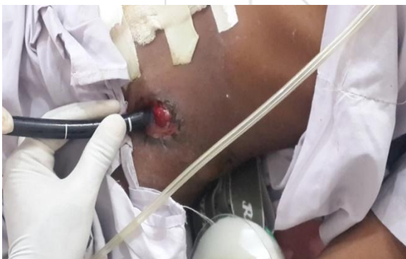
Figure 3: Image showing colonoscopy done from colostomy (stoma site)

Out of all 100 patients presented maximum patients presented with chief complain of altered bowel habits followed by pain in abdomen followed by bleeding PR and then other symptoms like perianal symptoms, chronic anemia, easy fatigability, chronic constipation or diarrhea.