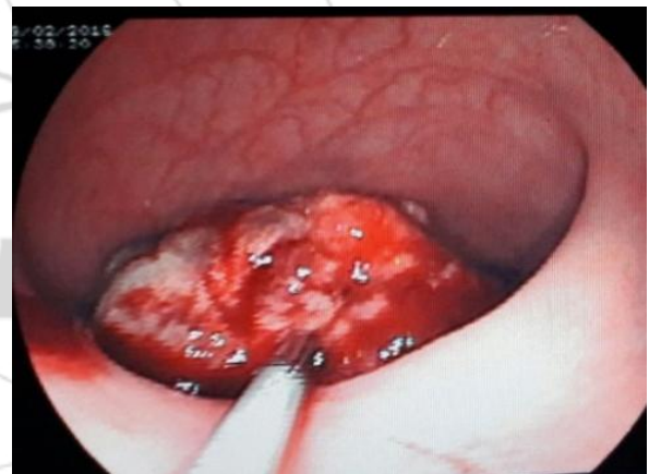
Figure 1: Image showing biopsy taken from colonic growth

In present study altered bowel habits with or without pain in abdomen 38% and 29% respectively were major presenting symptoms which were comparable to studies of D Smith et al, (4) Macrae FA et al 2011 (5) and Macrae FA et al 2016 (6) whose values were 49%, 13% and 43%, 44% and 1.3, 34% respectively.