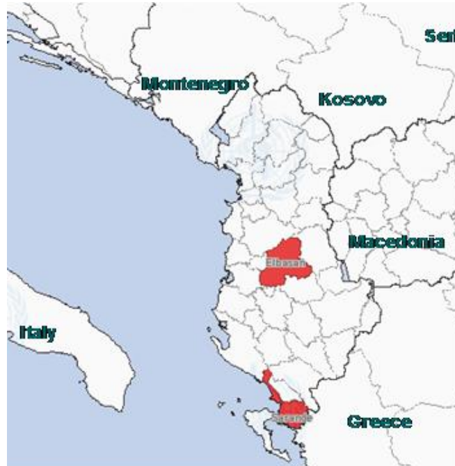
Figure 3: Transmission chain by index case imported from Greece