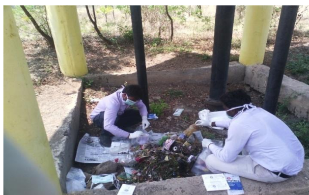
Figure 2.1: Showing solid waste sampling exercise