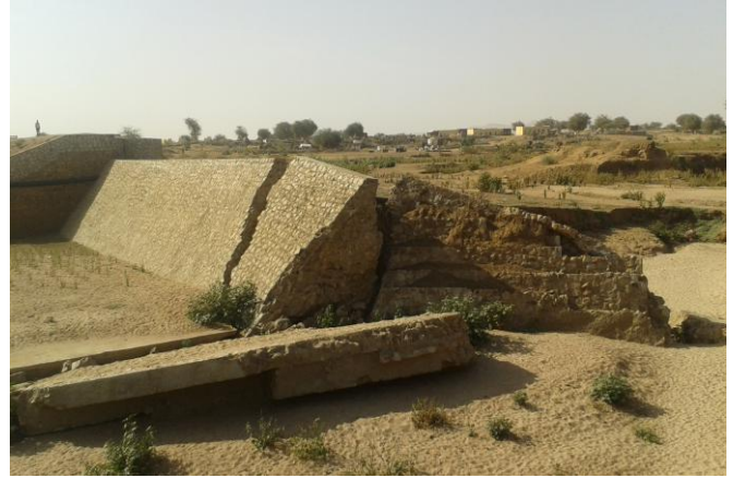
Figure 3: Damaged spillway with severe cracks

A visual inspection was conducted for the dam in order to detect any obvious structural defects in the spillways and the dam embankment. It was observed that the secondary spillway structure and the adjacent embankment of the dam collapsed due to excessive seepage that caused voids creation underneath the structure. The new constructed section of the secondary spillway has severed failure due to shear stress and washed away during the first rainy season. The reservoir is no more holding water. As per the information for the locals, the dam failure has occurred same year where the nearby secondary spillway was constructed and this had subjected to seepage underneath the embankment close to the spillway as shown in Figure 3.