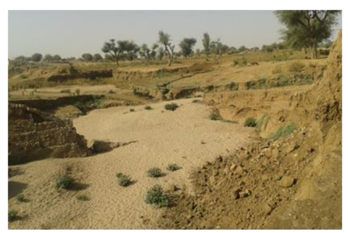
Figure 5: Sediment deposition in the reservoir area

In addition to breaching and weakening of the embankment, the other concern observed in Tawila dam is sediment deposition in the reservoir area. The sediment deposition has reduced the storage capacity of the reservoir by significant volume. This is mainly due to huge sediment load form the catchment is caused by degradation and less vegetation cover. There is no any sediment releasing sluice gate provision to release flush floods carrying high sediment load are experienced in other dams in Darfur. As shown in Figure 5, the sediment deposition lead to reduction in reservoir capacity as well as reduction in aquifer recharging to augments the ground water.