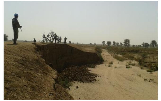
Figure 4: Weak and steep slope of the embankment

The partial breaching/weakening of embankment section is also observed at the far north part of the embankment which could lead to total collapse. This embankment weakening was happening mainly due to scouring effect of the incoming waddy which flows adjacent to the embankment section and parallel to the dam axis. This scouring has caused the embankment slope to get steeper and has increased the waddy depth which has increased the embankment height which can lead to failure (Figure 4). During rainy season, this steeper section was falling in to the waddy when it get saturated and washed downstream which further weakens the embankment section.