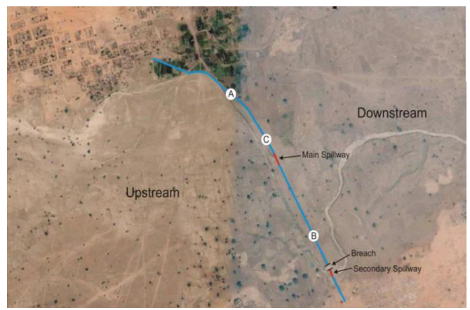
Figure 2: Location map of Tawila dam

Tawila dam is located about 70 km west of North Darfur capital El Fasher town; it was constructed in 1954 by the State Water Corporation. The dam is an earthen embankment (1.8 km long) across the wadi, with two spillway structures (primary and secondary). The project area is located in El ku basin of the North Darfur. The river is one of the main flow contributors to wadi El ku (Figure 2).