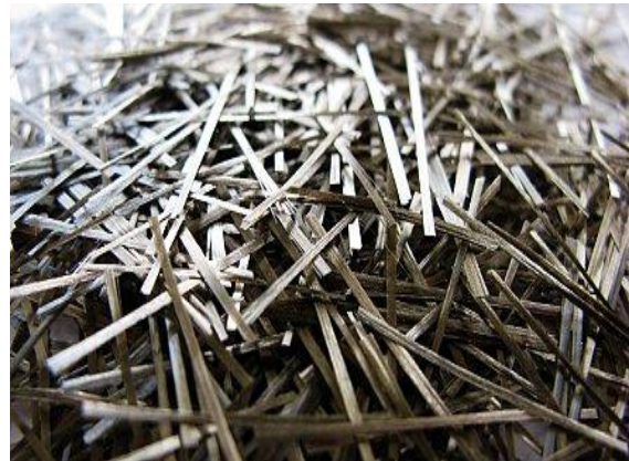
Figure 1.1: Basalt fiber

Basalt has a fine-grained mineral texture due to the molten rock cooling too quickly for large mineral crystals to grow, although it is often porphyritic, containing the larger crystals formed prior to the extrusion that brought the lava to the surface, embedded in a finer-grained matrix.