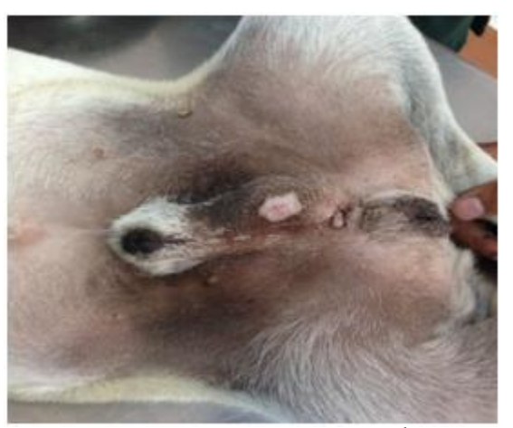
Figure 3: Animal condition after 10<sup>th</sup> day

Initially the animal was pre-medicated with atropine sulphate @ 0.04mg/kg body weight and xylazine hydrochloride @ 1.0 mg/kg body weight intramuscularly. The surgical site was prepared aseptically for prescrotal midline incision. Cefazoline (Reflin®) @ 25 mg/kg body weight and tramadol hydrochloride @ 2 mg/kg body weight were administered intravenously. The animal was kept under dorsal recumbency. Local infiltration of the area surrounding the ectopic testis was done with 8ml of 2% lignocaine hydrochloride solution. After five minutes the incision given on median raphe of prescrotal area on ectopic testis and the testicle was removed after ligating the spermatic cord. The testicular capsule and pampiniform complex were found to be inflamed but the testicle had a normal morphology. The scrotal testis was pushed towards the incision site and removed after ligating the spermatic cord.