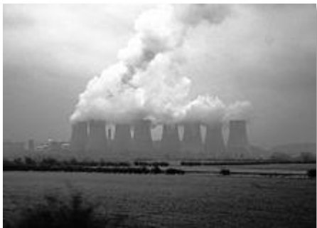
Figure 1: Smoke and steam sent out from chimneys of industries have high amounts of heat

Power generation: The electrical efficiency of thermal power plants is defined as the ratio between the input and output energy. It is typically only 30%. The image shows cooling towers which allow power stations to maintain the low side of the temperature difference essential for conversion of heat differences to other forms of energy. Discarded or "Waste" heat that is lost to the environment may instead be used to advantage.