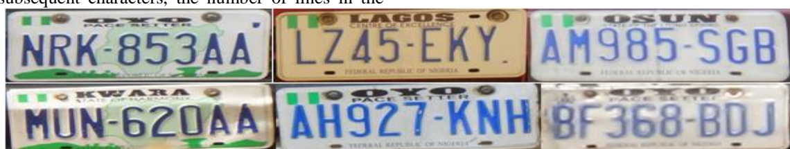
Figure 2: Standard vehicle plate used in Nigeria.

license plate, script etc. are maintained very specifically. Some of the images of standard vehicle license plates, used in Nigeria, are shown in Fig2.