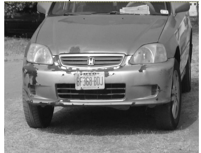
Figure 4: Gray scale image

Subsequently, the gray image is filtered using median filter in order to remove the noise, while preserving the sharpness of the image. The filter used is a non-linear filter where it replaces each pixel with a value obtained by computing the median of values of pixels.