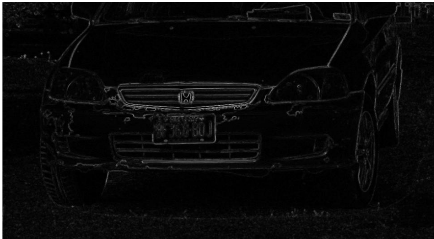
Figure 5: Sobel edge detection

If A is denoted as pixel values as in equation (3) then the gradient value is shown in equation (4)