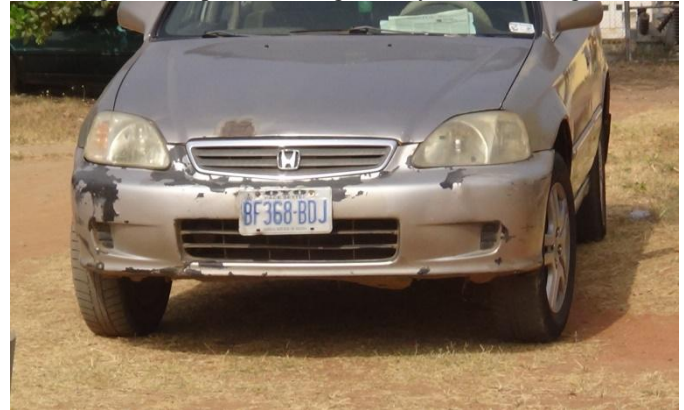
Figure 3: Original image

A digital camera is used to capture vehicle plate numbers that will be used as input to the proposed recognition system. The image was captured during the day and in the night.