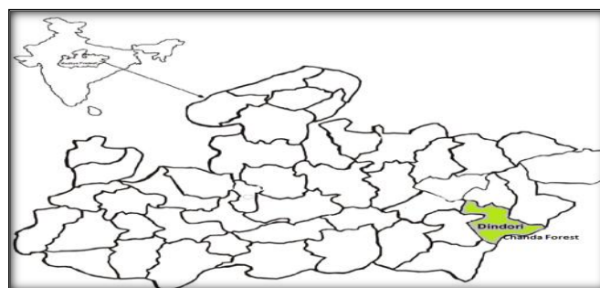
Figure 1: Location Map of India in Madhya Pradesh

in December. Chanda forest is total area of 2181.14 hectare. Chanda forest is a very rich of Botanical wealth and a large number of diverse wild edible plants that are used by different Ethnic people for medicinal purpose grow wild in different parts of the country. The tribal people of the Chanda forest district Dindori practice a various range of occupation such as hunting, gathering, fishing, plough agriculture and shift agriculture is the main stay of the tribals. Regardless of their principal mode of subsistence they collect and consume major and minor forest product ( Figure 1 and Figure 2 ).