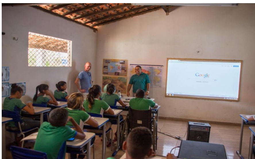
Ray of Hope: Google Team with students at Linoca Gayoso School

Recently Project loon took one more step forward in expanding the world by testing its new LTE radio technology in the rural outskirts of North east Brazil at a rural Brazilian school, Linoca Gayoso which currently doesn't have any internet access. LTE (Long Term Evolution) is a wireless broadband technology designed to support roaming Internet access via mobile phones and other devices. The benefits of this 4G technology are its long range of operation along with high speed. The other important advantage that this technology has is that it uses the same type of signals that telecom companies use for the cellphones. "This means that when Loon partners with telecoms to deliver last-mile connectivity, we will be able to use the telecommunications companies' existing infrastructure, which will allow us to deliver service to rural and remote users seamlessly and quickly," Google said. So in the near future it would also be possible to provide internet access directly on the mobile phones.