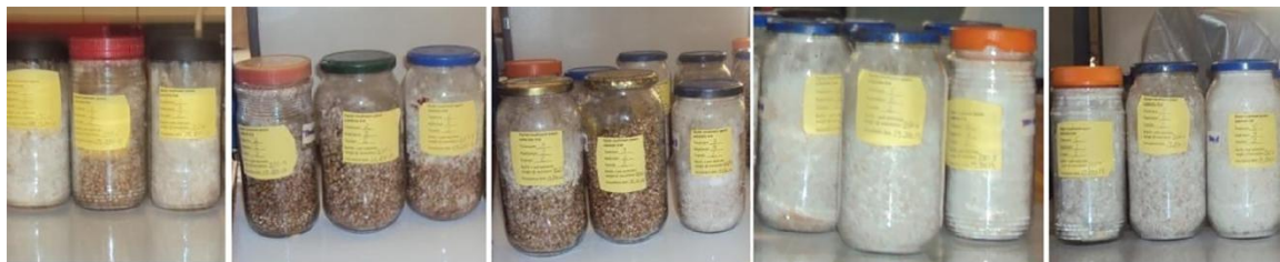
Figure 3: Mycelial coverage 20 DAI

Figure 3 indicates from left to right in order of their arrangement the extent of mycelium coverage 20 DAI in treatment 1, 2, 3, 4, and 5. The picture for treatment 4 appears to be more vigorous and covered with white bright mass of mycelium suggesting the noticeable quality difference between treatment 4 and 5 regardless of the equivalent score they share in PMC.