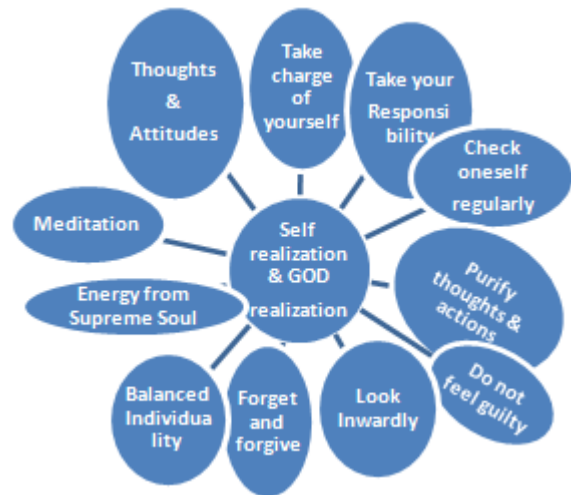
Figure 2: Cycle of Spirituality and Meditation