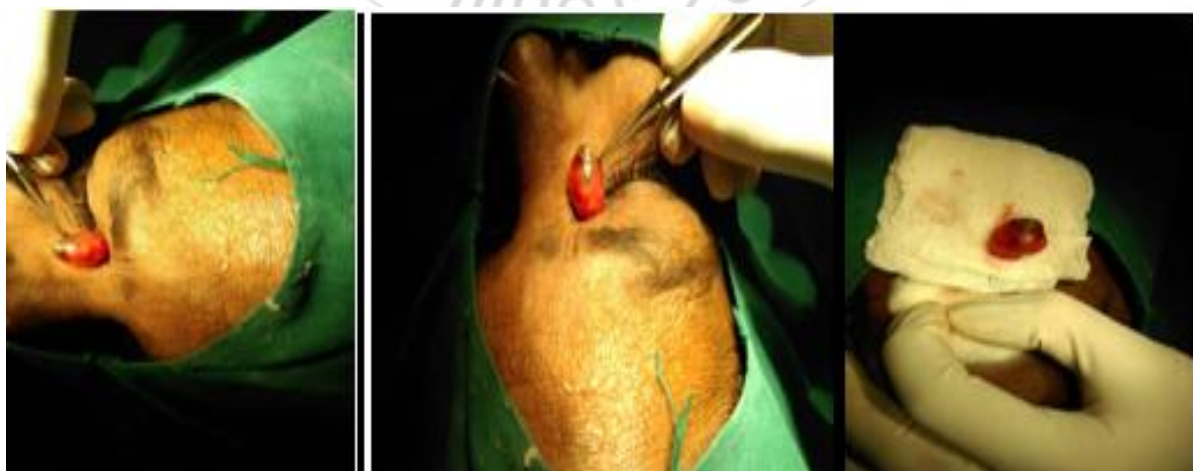
Figure (1-3): Excision of the tumour mass situated in the lacrimal gland. Picture showing the modified excision of the lesion.

In summary, these results emphasize the immense variety of cells, architectures and morphological characteristics present in PA of the salivary gland. Since PA is the most frequent salivary gland neoplasia and can resemble other salivary gland tumors, the knowledge about these variations and locations is essential for a correct diagnosis.