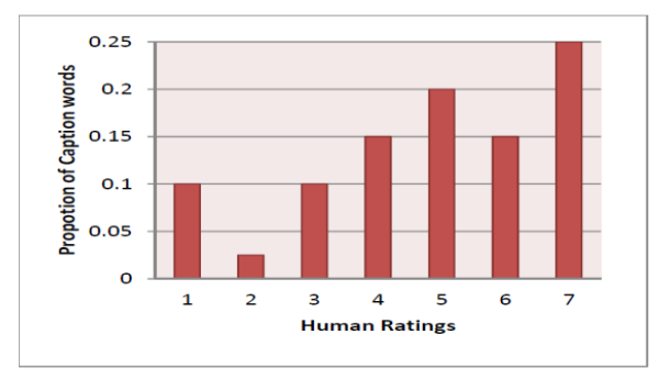
Figure.1 Proportion of caption words given a rating by human judges.