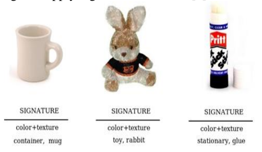
Figure: Encoding correspondence between visual features to keywords.

A handful of approaches have been proposed in the literature that automatically generates descriptions for images by examining their content. To begin with, the image is represented by image features, which are then replaced by an abstract representation, essentially a set of description words, according to a visual-to-textual representation dictionary[1][3]. The features used to represent the image content mainly include color information [2], textual features [3], detected edges [1], and so on. For certain applications, some objects are detected and recognized with prior knowledge to supply higher level features [4].