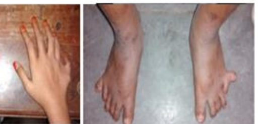
Figure 3: Showing Polydactyly