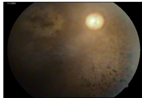
Figure 2: Fundus picture showing bony corpuscular pigmentation and consecutive optic atrophy