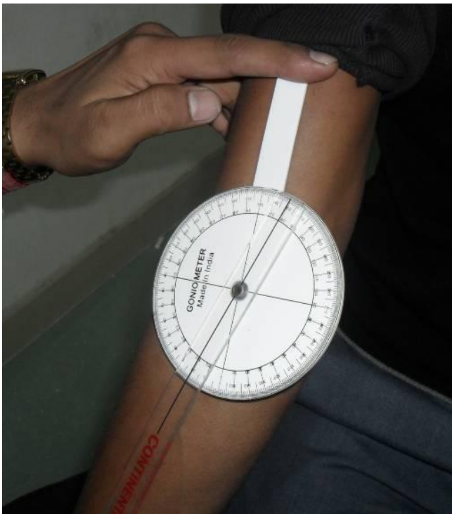
Figure 1: Showing the observation of normal carrying angle