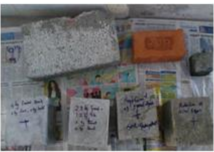
Figure 2.1: Chosen Specimens C1, C2, C3, C4 and C5

In this present study, we investigate the Physico-Chemical Properties for chosen five numbers of Concrete Specimens namely, C1, C2, C3, C4 and C5 shown in Fig.2.1. Test specimens were made of concrete cube of 150mmx150mmx150mm. The details of specimens along with their Mix proportions was made for Mix Design of M30 & M40 Grade of concrete as per IS 10262 [5] and the NDT Methods Ultrasonic Pulse Velocity (UPV) (Used Pandit lab model, Proceq Make Equipment was shown in Fig2.2) and Rebound Hammer Test (Used Schmidt model, Proceq Make Equipment shown in Fig 2.3) were carried out as per IS 13311(Part1) and (Part2) [6, 7]. The age of Concrete specimens is 28 days.