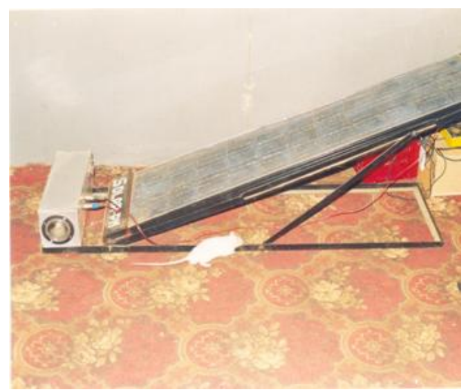
Figure 3: The rat is seen running away from the room as a result of the ultrasonic frequency.