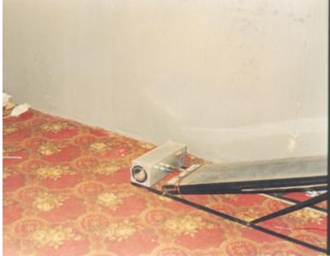
Figure 4: The rat is seen irritated and demobilized as a result of the ultrasonic repeller.