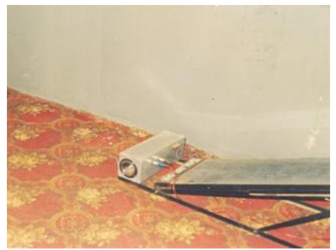
Figure 5: The mice is seen disturbed and irritated and is trying to run away from the room because of the ultrasound from the repeller