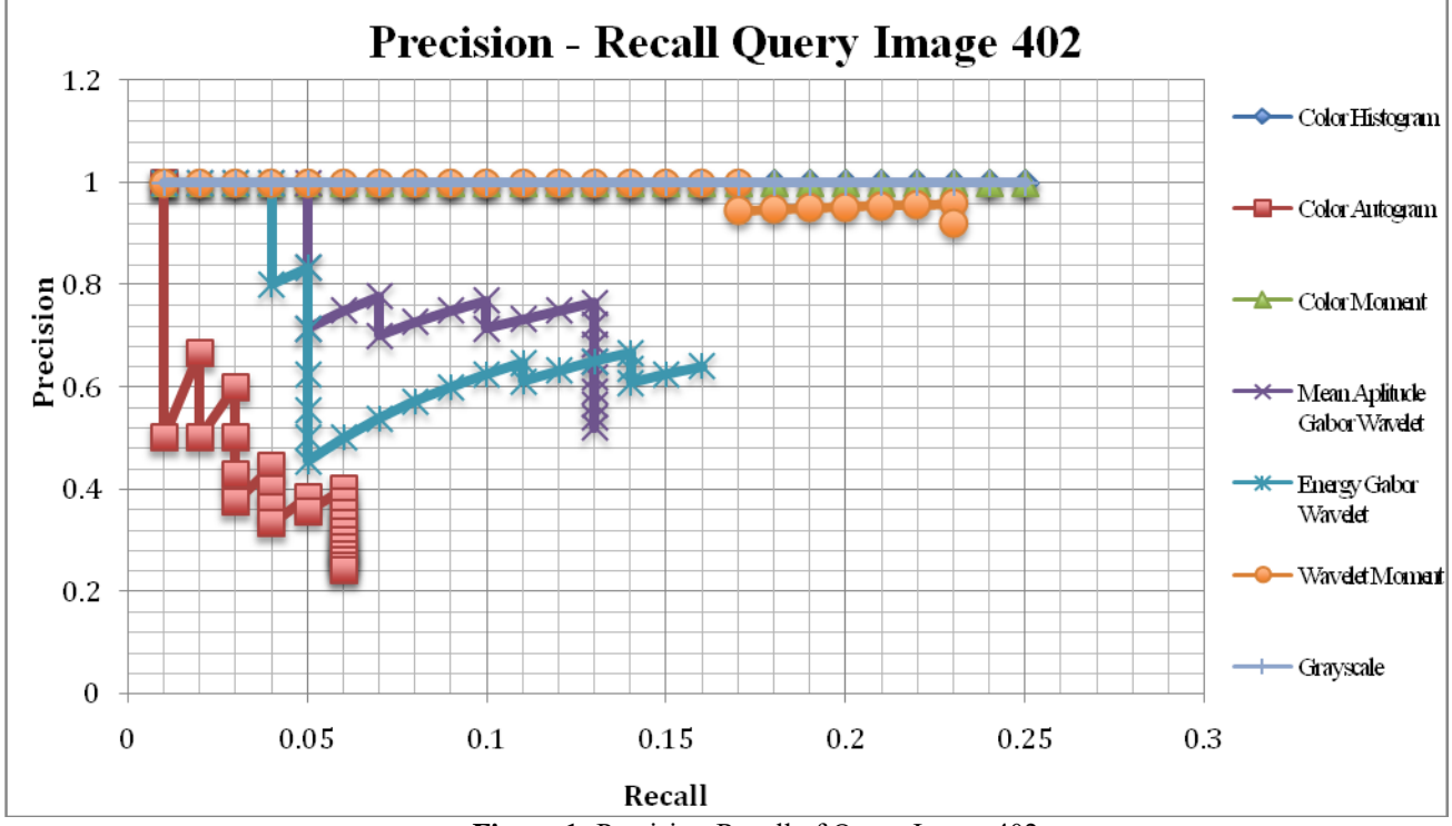
Figure 1: Precision-Recall of Query Image 402

Based on Table 1, 2, 3, 4, and 5, there is no particular feature resulting high consistence precision value among all classes. The main reason of this result is that the color and texture complexity of the images in each classes are different. Based on Table 6, color moment has 70% of average accuracy in