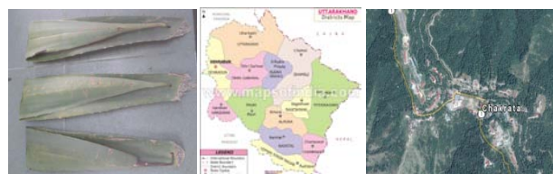
Figure 1: Agave sisalana leaf sheath Figure 1a: District map and satellite image of the plant collection site

Leaves of Agave sisalana (Figure: 1) were collected from Chakarata Tehsil which is situated at an elevation of about 7000-7250 feet amid the Tons and Yamuna Rivers adjoining the state capital of Uttarakhand state, India (Figure:1a). The collected plant material was identified by Systemic Botany Division, FRI, Dehradun.